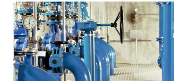
Supplying water for the City of Schwerin

For many years now, REMONDIS Aqua has been providing districts, cities, water associations and industrial companies with reliable services – both at home in Germany and abroad. A number of references have been given below. An extensive list of both national and international references can be found on our website.