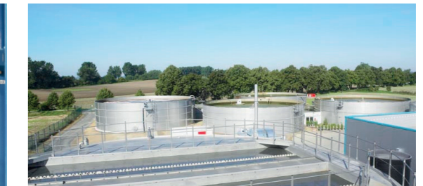
Deutsches Milchkontor in Altentreptow

Wasserversorgungs- und Abwasserentsorgungsgesellschaft Schwerin mbH & Co. KG (WAG) is responsible for supplying the 100,000 people living in the German city of Schwerin with drinking water. The company is also in charge of managing the wastewater operations of Schweriner Abwasserentsorgung (SAE), a firm owned by the City of Schwerin. EURAWASSER, a part of the REMONDIS Group, has owned a 49% share in WAG, a subsidiary of Stadtwerke Schwerin GmbH, since its foundation in 2003.